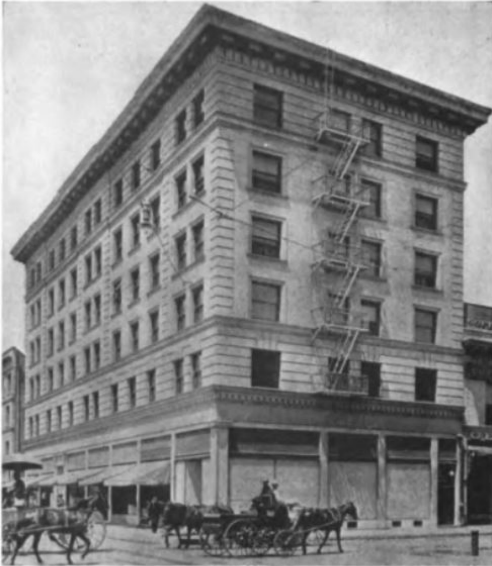
KING EDWARD HOTEL, FIFTH AT LOS ANGELES STREETS