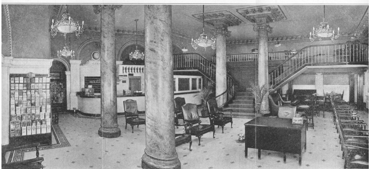
Figure 4 King Edward Hotel lobby, circa 1925