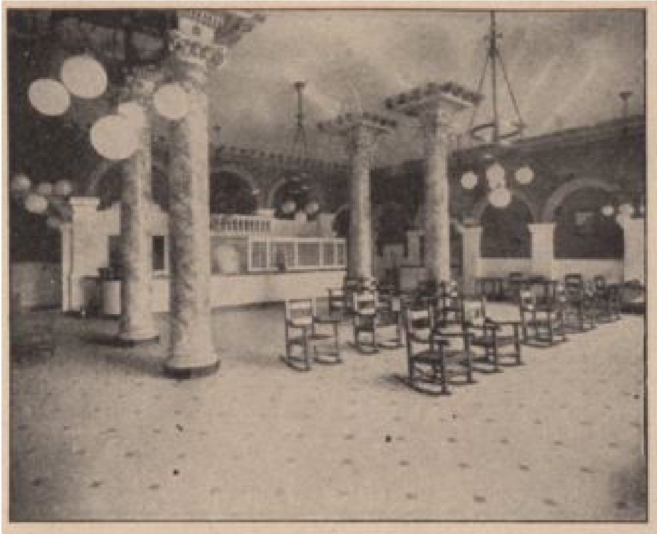
Figure 3 King Edward Hotel lobby, circa 1908-1918